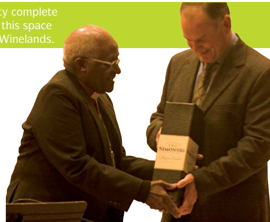
ARCHBISHOP DESMOND TUTU AND FRANCOIS MALAN